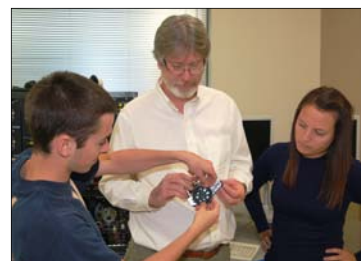
Gonzaga's School of Engineering and Applied Science is celebrating 75 years as an innovative, mission-driven source of quality engineers and computer scientists.

pose." In the past year engineering students have also worked on developing life-saving sensors for emergency workers in distant locations, solar grain dryers for Third World countries and better tracking of adverse drug reactions.