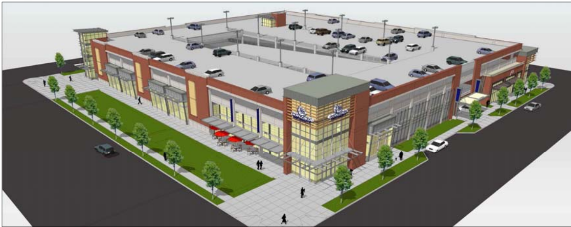
This is an artist's rendering of one possible design for the parking garage at the corner of Cincinnati and DeSmet.

Coughlin Hall was Gonzaga's last major construction project, completed in August 2009.