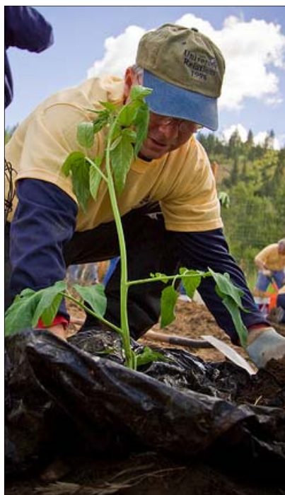
University Relations spent a day volunteering in a local community garden.

To create a centralized place for faculty and staff to be aware of current and