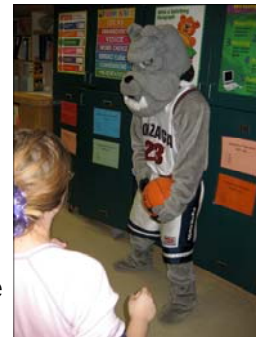
Spike and UR staff members visit Logan Elementary in January.