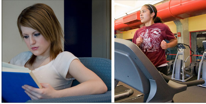
Dual lives: Gonzaga students seem to strike a healthy balance between study time and workout time.

We thought we'd find out for ourselves, with a little help from the people who actually know, of course. According to Valerie Kitt , circulation supervisor at Foley, nearly 70,000 people walked through their doors in September, peaking to more than 80,000 in October and dropping under 60,000 in December. Rudolf Fit-