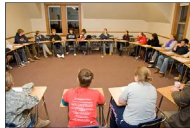
Exploring different learning styles.

For questions or more information about the initiative, contact Easterling at ext. 6682 or easterling@gonzaga.edu .