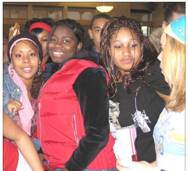
The third annual Get Connected Career Day on Nov. 22 brought nearly 300 youth of color to campus from Spokane-area schools. Participants learned how to prepare for college and a career. "It's pretty exciting to me," one student said.

The McCarthy Center concourse came in for particular praise from judges. The expansive windows provide "wonderful visual connections with the campus," wrote one judge. Other judges praised the scale of the entry, the degree to which the McCarthy Center relates to surrounding buildings, and the intimacy provided by the sharply raked seating. The awards were presented on Nov. 16 in Las Vegas.