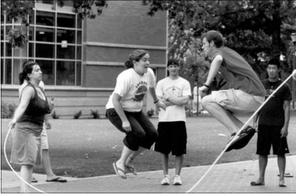
RAs and RDs jump into action in this team-building exercise as they prepare for onslaught of new students.