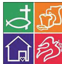
Jesuit Volunteer Corps Logo

Since 1956, the Jesuit Volunteer Corps has offered men and women an opportunity to work full-time for justice and peace, both locally and abroad. They are called to the mission of serving the poor directly, working for structural change in the United States, and accompanying people in developing countries. The challenge to Jesuit Volunteers is to integrate Christian faith by working and living among the poor and marginalized, by living simply and in community with other Jesuit Volunteers and by examining the causes of social injustice. To date, there are more than 12,000 former Jesuit Volunteers.