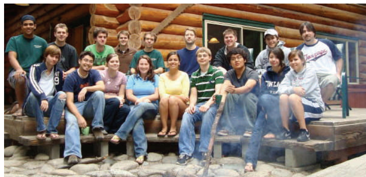
2008 GU Debate Team