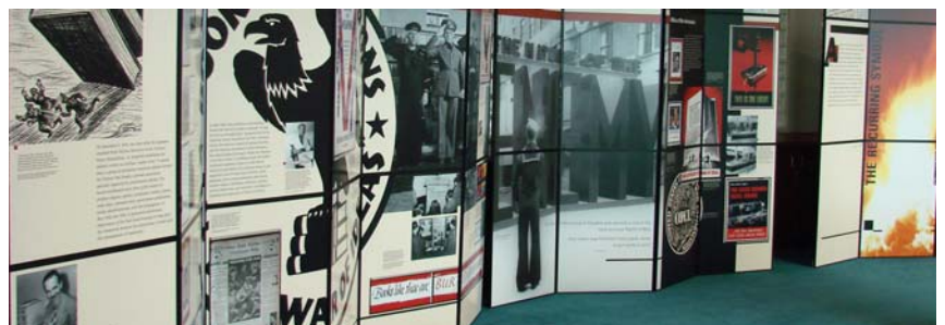
Exhibition displays in the Special Collections Rare Books Room