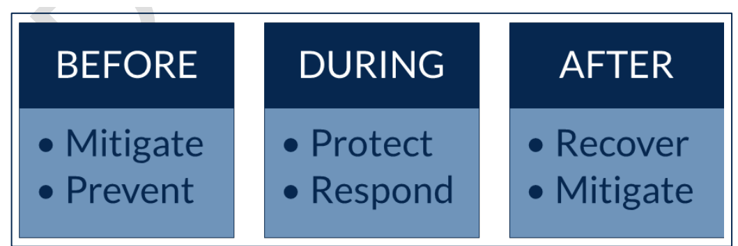
Figure 2 Phases of Emergency Preparedness

Preparedness activities occur before, during, and after an emergency or disaster event. Mitigation and prevention activities are most effective before an event occurs, while protection and response efforts occur during the event. Recovery operations, and new mitigation projects, occur after the event has concluded, which also serves to transition the cycle and the proactive activities resume. Figure 2 illustrates this relationship.