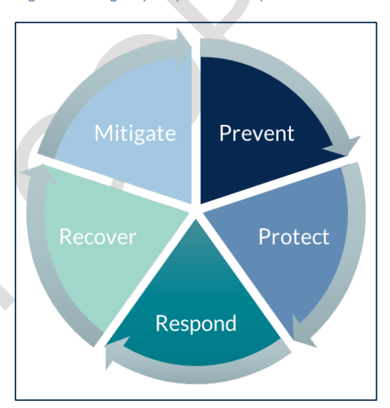
Figure 1 Emergency Preparedness Cycle

Gonzaga University utilizes an emergency preparedness process to guide all plans and programs developed to address emergencies or disasters that could occur on, or impact, campus. The emergency preparedness process is a cycle that encompasses five major phases: prevention, protection, mitigation, response, and recovery. Each set of capabilities (including skills, plans, training and education efforts, and response actions) build on the prior phase to create a comprehensive preparedness approach to emergency preparedness. Collectively, these activities are also called 'emergency management' and the terms are used interchangeably. The emergency preparedness cycle is illustrated in Figure 1.