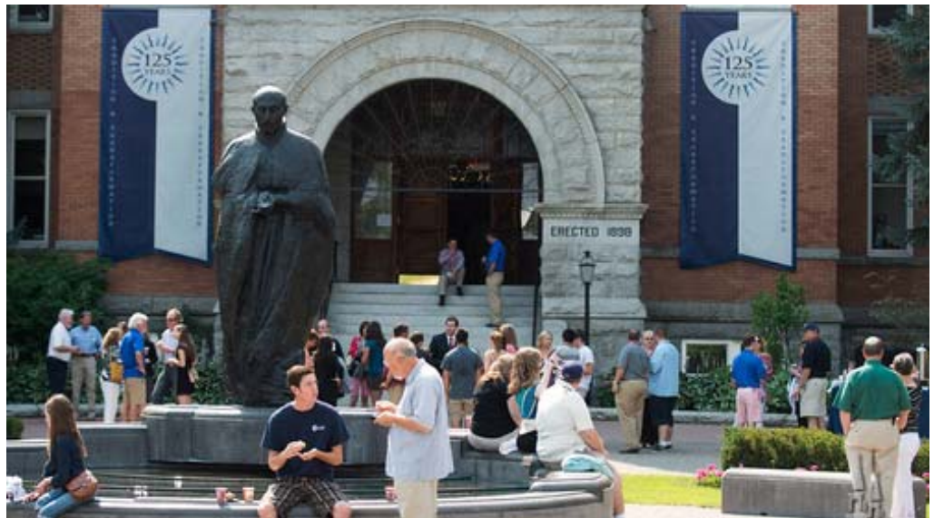
Gonzaga opened its doors Sept. 17, 1887.