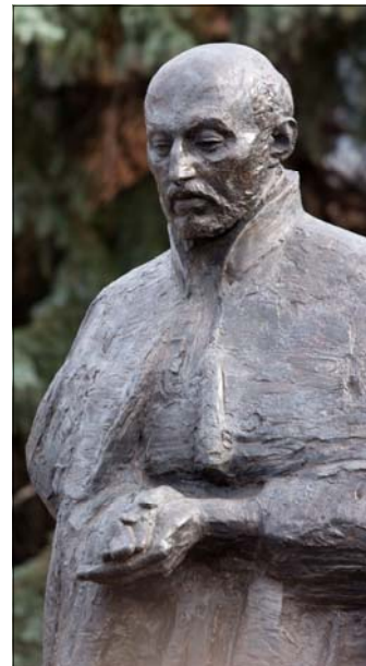
St. Ignatius will welcome students to Gonzaga for hundreds of years to come.