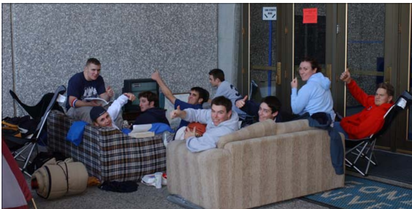
Free basketball tickets will be limited to two for staff/faculty, one for students, which should help alleviate long waiting lines.