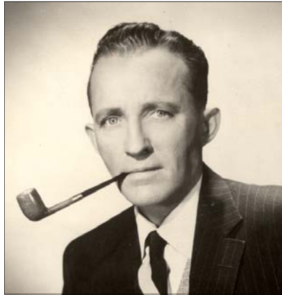
Bing Crosby Left Gonzaga in 1924, but kept coming back