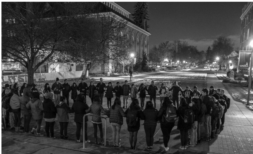
Submitted by Julia Bellia

I am change. us women, workers of light- we bloom time and time again. sometimes we are obscured in darkness, but we will always find a way to radiate light.