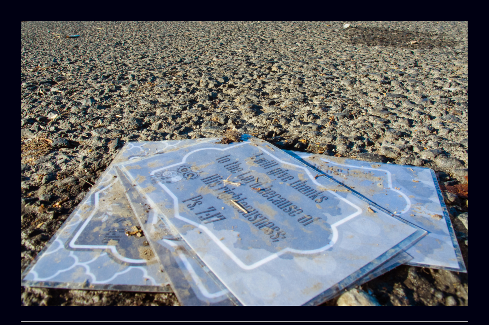
This prayer card was found outside of a barren warehouse just a few blocks away from a church in session. It had clearly spent some time on the ground, unnoticed, driven over, and walked on. Seeing these holy sigils laying forgotten on the ground was a startling and surprisingly impactful encounter that drives one to reflect on how they nurture and share their spirituality with those around them.