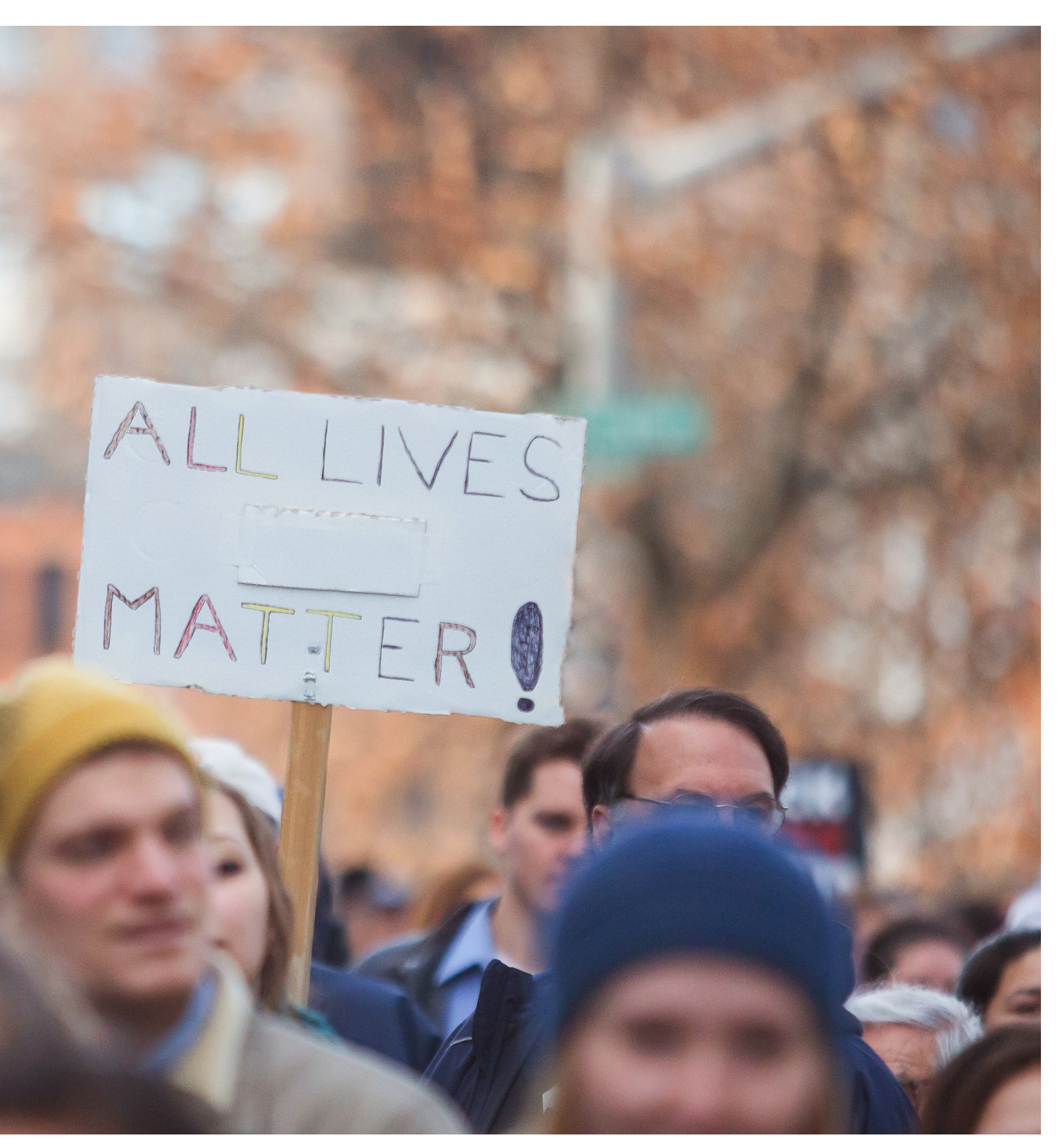
The Martin Luther King Jr. March wound through downtown Spokane on January 19, 2015. The March began at the INB Performing Arts Center with speeches about justice and equality before taking to the closed off streets. Participants from all different backgrounds and ages marched together playing music, holding signs or hands, and promoting social justice and equality for all. Photo and caption by Mark Rawson.