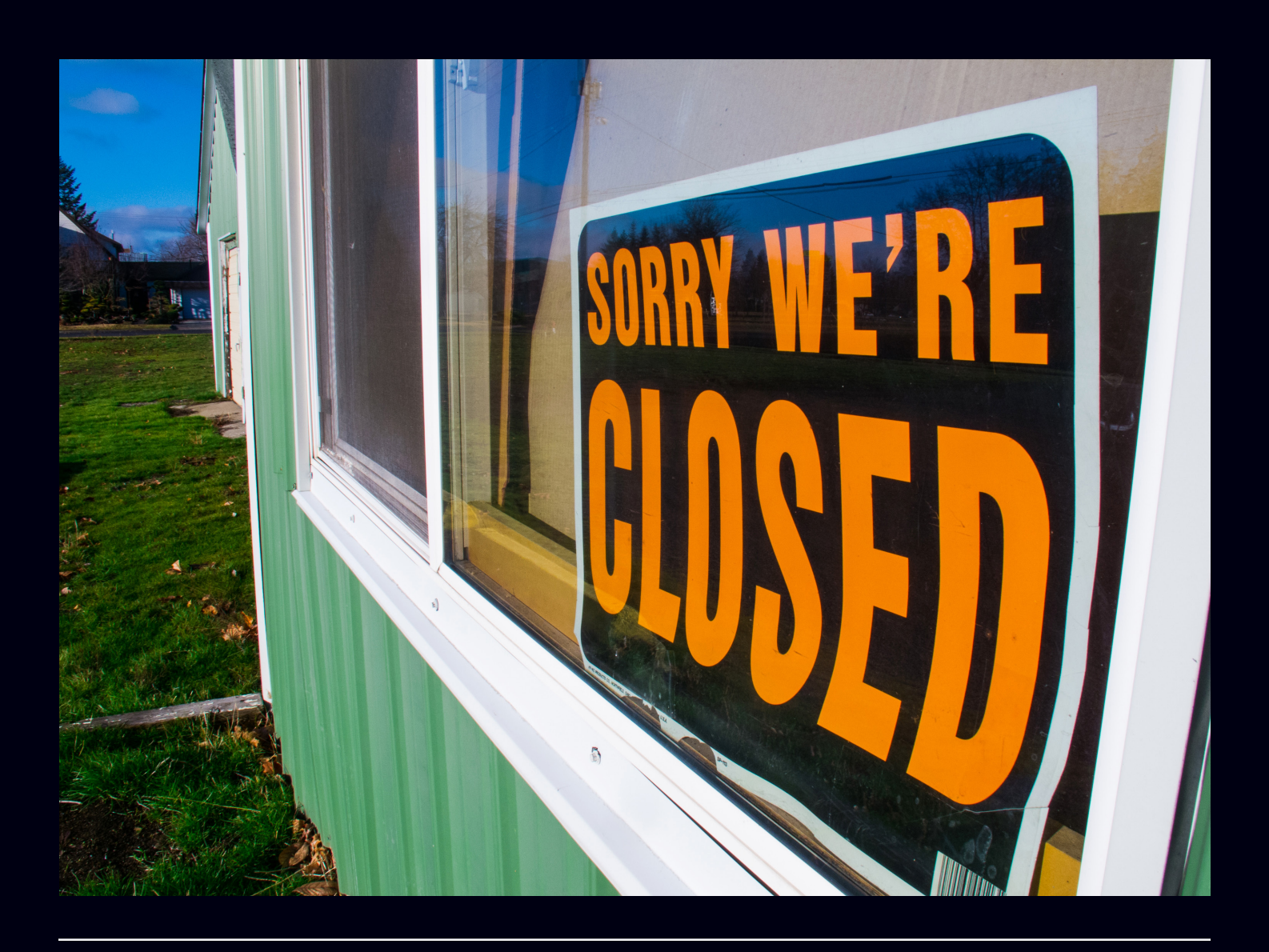
While strolling through the backstreets of Spokane, this candy green building stood out among a spattering of run-down looking structures as a potentially lively entity. The nearest signpost stood without a sign. Around the side of the building, the window displayed 'sorry we're closed.' Everything in the neighborhood, no matter how vibrant or drab, appeared to be deserted. Photo and caption by Zack Jankelson.