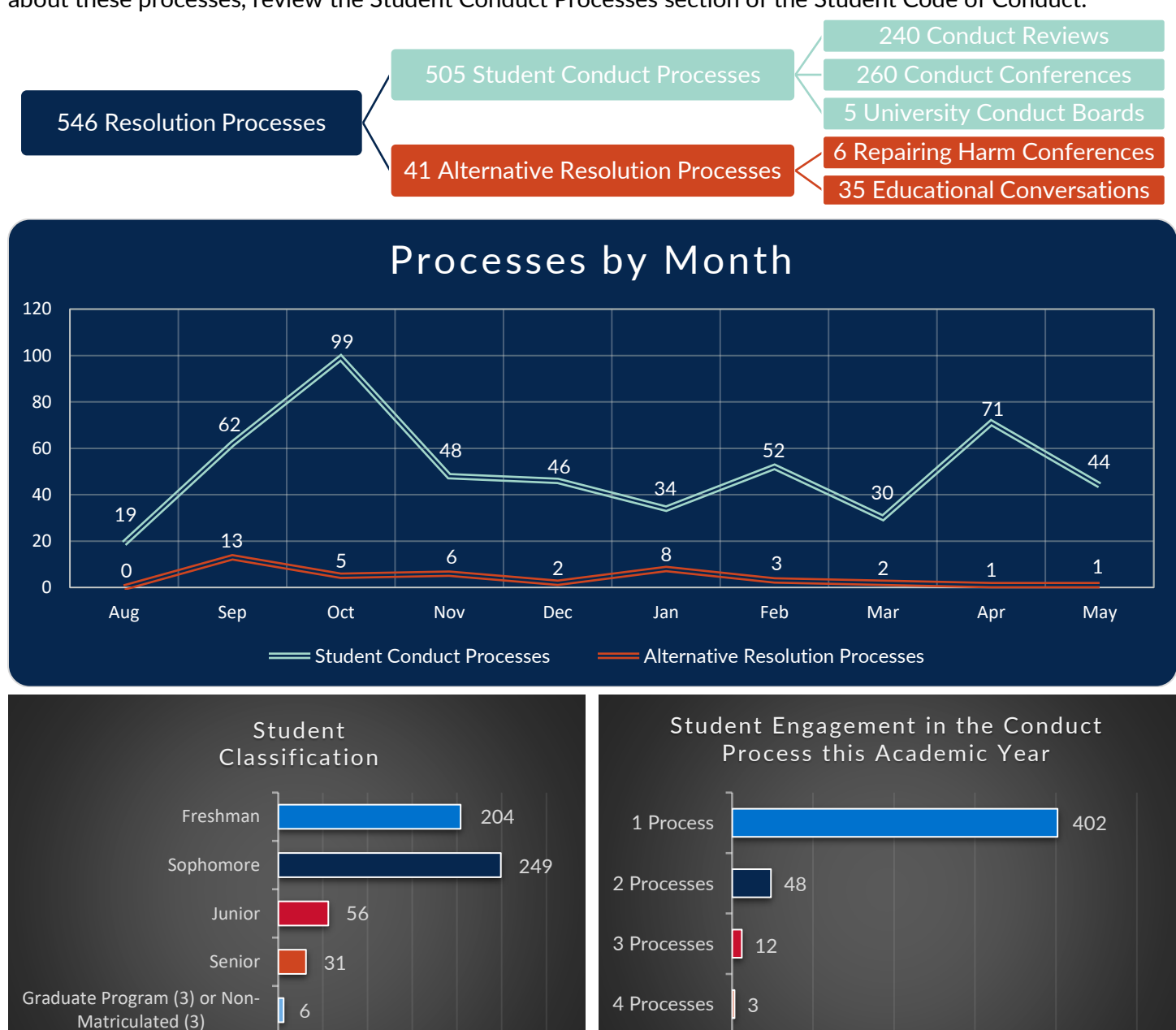
Resolution Center for Student Conduct and Conflict

If the RC determines that a report may constitute a violation of the Student Code of Conduct, a Student Conduct Process or Alternative Resolution Process will be initiated to resolve the report. For more information about these processes, review the Student Conduct Processes section of the Student Code of Conduct.