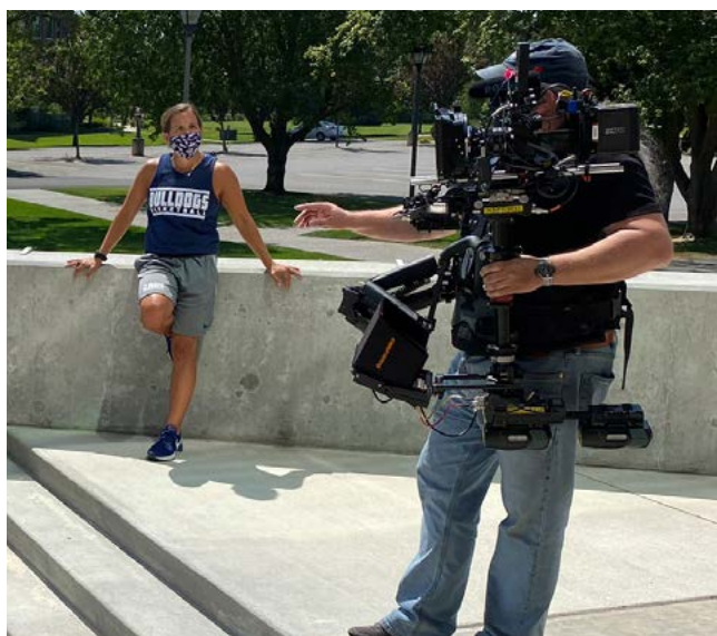
Nolen packs up to 100 pounds of equipment shooting for Gonzaga.