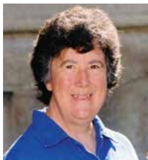
GONZAGA UNIVERSITY ARCHIVES