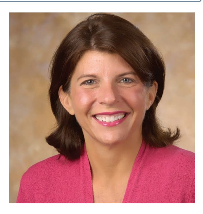
Closing Plenary, April 4, 2:00 pm - 3:00 pm (Auditorium 004)