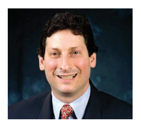
April 3, 9:00 am - 9:50 am Ballroom

Centers for the Study of Hate Consortium: Bard Center for the Study of Hate, the California State University San Bernardino Center for the Study of Hate and Extremism, the UOIT Centre on Hate, Bias and Extremism, and the International Network for Hate Studies.