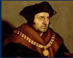
Sir Thomas More 1478-1535