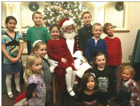
Santa with children of SOE faculty and staff

The School of Education hosted an annual Christmas Social for faculty, staff and their families. The SOE supports charities throughout the year, but always select 2-3 organizations for the Christmas season. This year, faculty and staff donated children's warm clothing, socks, toiletries, and children's toys for Trinity Catholic School, Union Gospel Mission, and Toys for Tots.