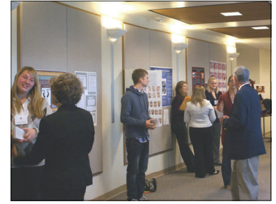
Poster Presentation Session at WCA Conference

The conference was a great opportunity for the students in Washington state, and especially in the Spokane area to begin a pattern of community involvement and to become connected with the local community of professional counselors. The conference received excellent feedback and was a great success.