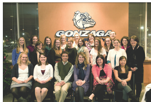
Pictured are Fall 2010 Student Teachers