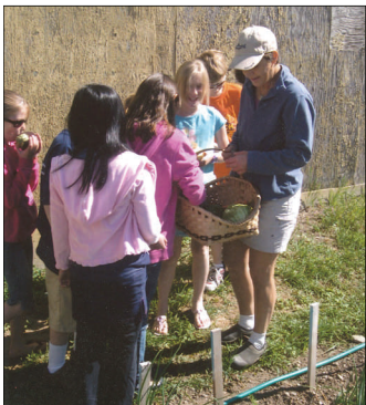
4th Grade Students From Lidgerwood Elementary