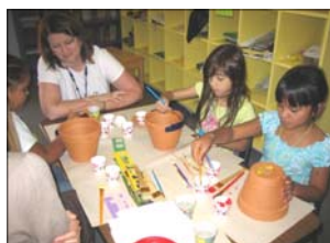
MIT students helping the children at the YWCA with art project gifts for senior citizens in Spokane

For the past three years, graduate students in Gonzaga University's Master of Initial Teaching program have taught art, reading, science, and other lessons to homeless youth in the YWCA's after-school and summer programs. The instruction goes beyond the classroom as teachers and at-risk students spend time together at the YWCA. GU students serve as mentors and gain teaching experience while they learn lessons in service and social justice, the resilience of youth, and how solidarity and sustainability go hand in hand.