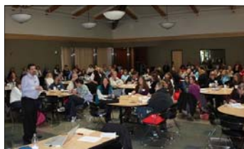
WORD Conference activities at Gonzaga University campus

The School of Education, Department of Teacher Education and the Kappa Delta Pi Honor Society sponsored and hosted the WORD annual conference: The Art of Student Engagement on the Gonzaga University campus the weekend of October 9 th and 10 th , 2009. WORD celebrated its 50 th anniversary and had over 200 educators in attendance from Washington, Idaho, and Oregon.