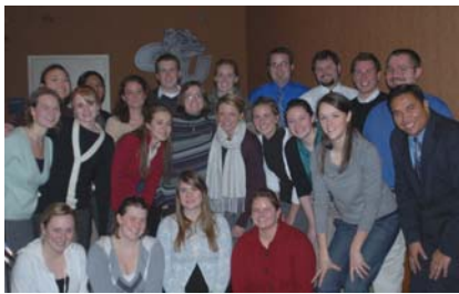
Fall 2009 Student Teacher Celebration