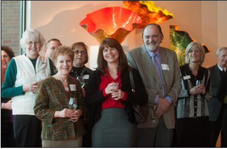
SOE Faculty and Principals from the Catholic Diocese of Spokane Schools