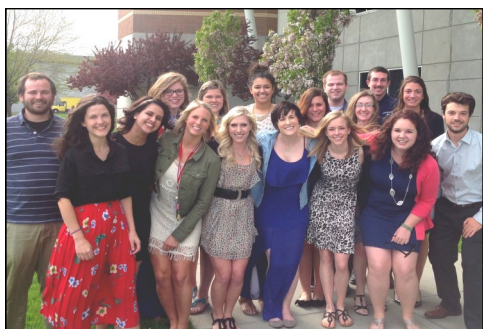
Spring 2014 MIT Student Teachers

A celebration was held on May 8 th , 2014 to congratulate students who completed their student teaching in the spring semester. Twenty-one student teachers from the Departments of Special Education, Sport and Physical Education, and Teacher Education were recognized. University Supervisors, Cooperating Teachers, and SOE administration and faculty were also in attendance at the dinner.