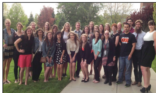
Spring 2014 Undergraduate Student Teachers