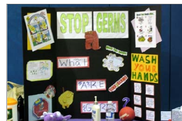
Poster presentations by GU students for the Health Fair at Day in Motion

to help coordinate the activities and contact local sponsors for prize incentives for the students. In 2006, when "Day in Motion" was moved to the Gonzaga University campus, in addition to the activities portion, a mini health fair was added to the event. The health fair gives GU students an opportunity to prepare poster presentations and discuss personal hygiene, food safety, and environmental issues. This event has been an excellent opportunity for the GU Sport and Physical Education students to have some real world experience in working with Pre-K through 8 th grade children and the health fair is also a major "project" for these students in their Introduction to Health class. In addition to the students involvement, the department faculty and staff give countless hours guiding the coordination and administration of "Day in Motion."