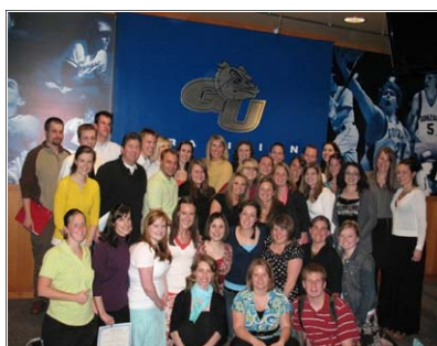
Student Teacher Celebration