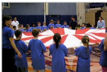
GU and Trinity Catholic School students at Spring 2009 Day in Motion