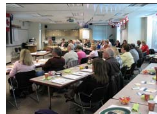
DELA Adjunct Faculty Assembly

In conjunction with the 2009 Graduate Commencement Activities, the Department of Educational Leadership & Administration invited adjunct faculty to campus for an information session related to site-based education and the newly revised curriculum program. Thirty-two adjunct faculty currently teaching in 20 sites throughout British Columbia, Alberta, and Washington attended the assembly. Attendees commented on how valuable the assembly was in bringing everyone together in the same space to meet one another and share ideas. Department faculty who teach the same stream of courses were paired up with adjunct faculty to discuss the revised program.