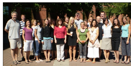
Canadian Cohort Summer 2007

The Master of Arts in Community Counseling and the Master of Arts in School Counseling is now fully accredited by the Council for Accreditation of Counseling and Related Education Programs (CACREP).