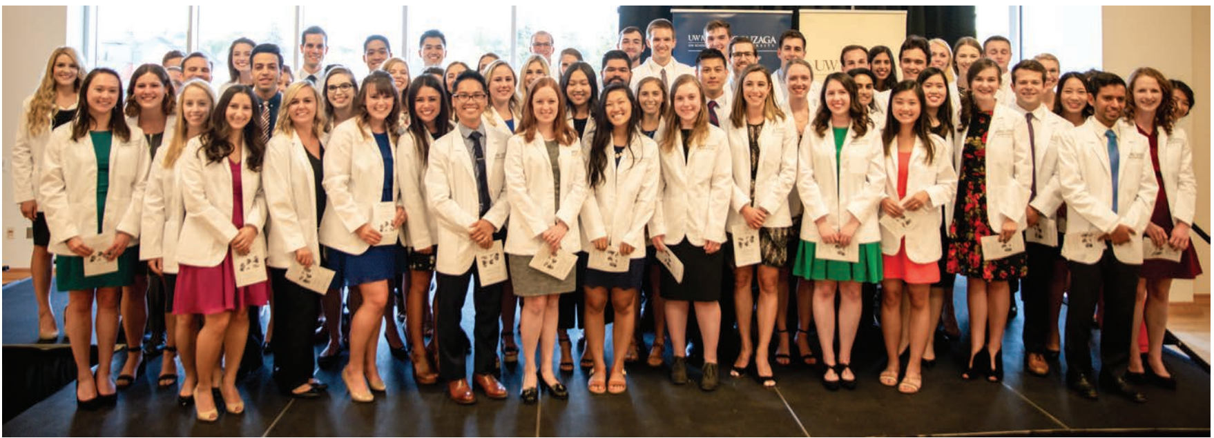
The 2018 entering class of UW School of Medicine Spokane students is thriving as they experience a college campus, experienced faculty and a supportive community.