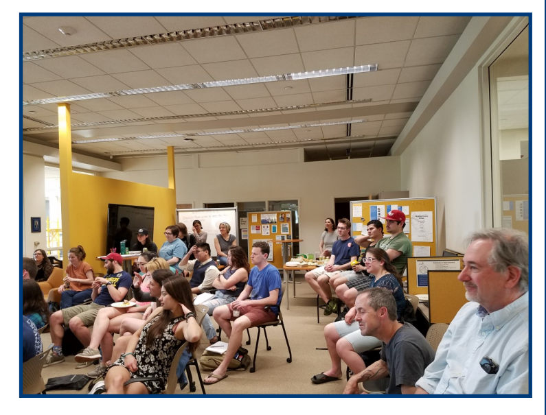
Captivated listeners in the GU Writing Center, listening to guest writer Hanif Abdurraqib

The close attention to language seems to me as important an endeavor as any we can undertake. It borders on cliché to say humans are the language (or story) making animals, but it is an evolutionary "miracle." Taken further: we are, as individuals, as subjects, constituted by language: it is in a large system of a given language that we identify our own idea of who we are, what we feel, of what is right and what is wrong. And through that language (already socially given), we are able to negotiate and renegotiate all of those notions. The great 20th century philosopher Ludwig Wittgenstein leaves us a pair of famous axioms that have moved and influenced me throughout my adult life: first, "The limits of my language mean the limits of my world"; and second, "what we cannot speak of we must pass over in silence."