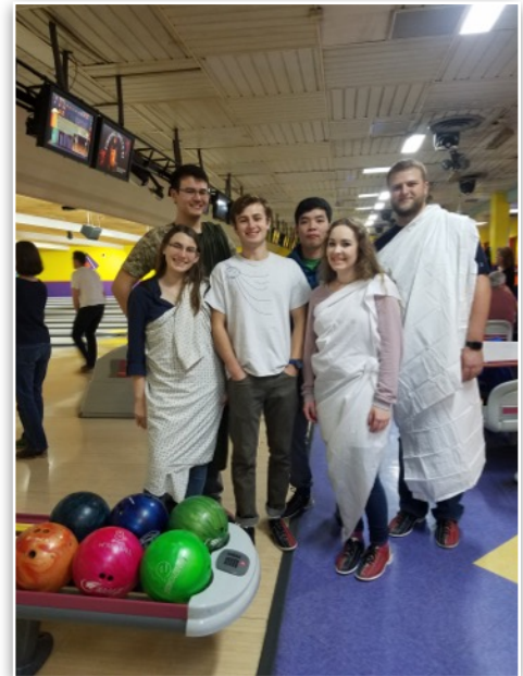
The Classics Club toga bowling in November

Can't get enough of the ancient world? We always have more! For details on upcoming events in the CLAS Department, follow us at