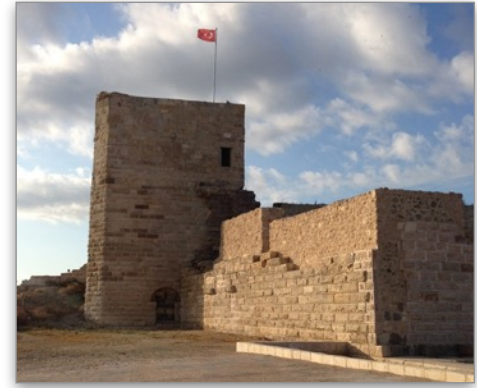
The kale , or castle, of Sinop

The Sinop Kale Excavation (SKE) has just completed its 3rd (2017) season of fieldwork at the ancient city of Sinope, on the Black Sea coast in N. Turkey. Excavation on the kale (= castle) hill in the ancient city continued in four trenches over a period of five weeks (early July to mid-August), with an international team of over 40 people from 10 different countries. We also ran the 2nd year of the Gonzaga-in-Sinop archaeological field school, with six U.S. undergraduates and three Turkish students from Hittite University participating. This year's crew had a bumper crop of past and present CLAS and History students: eight GU-affiliated team members took part in different aspects of the operations (excavation, drawing, photography, etc.)