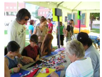
Craft tables at the 6th Annual Staff/Faculty Family Picnic