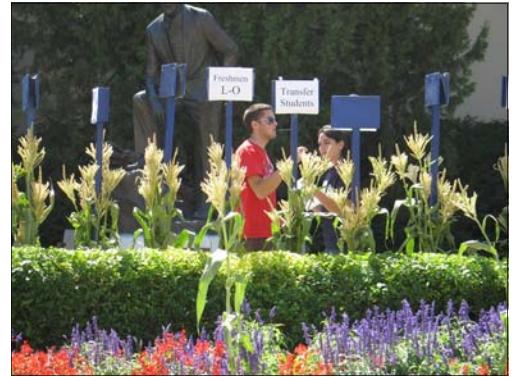
Orientation: Student volunteers handle a mountain of planning.