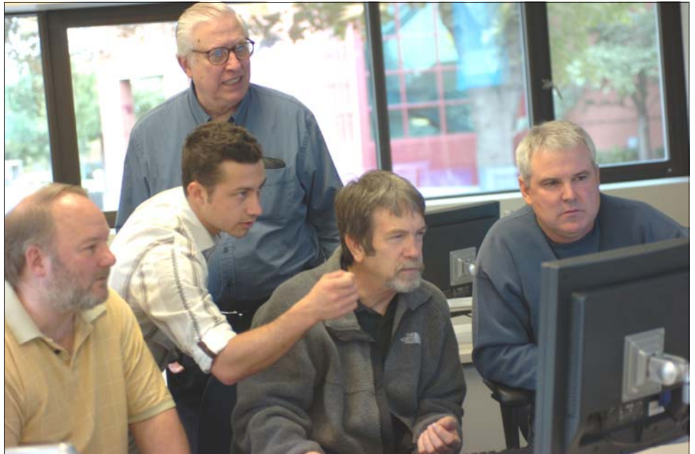
The first session of ZagOps, state-of-the-art emergency training for utility operators, took place in September under the auspices of the T&D program. If there's a four-state black-out coming at us, these fellows will know how to keep our lights on.

The enrollment this fall is 15 students. As the program continues to roll out courses, it's ex-