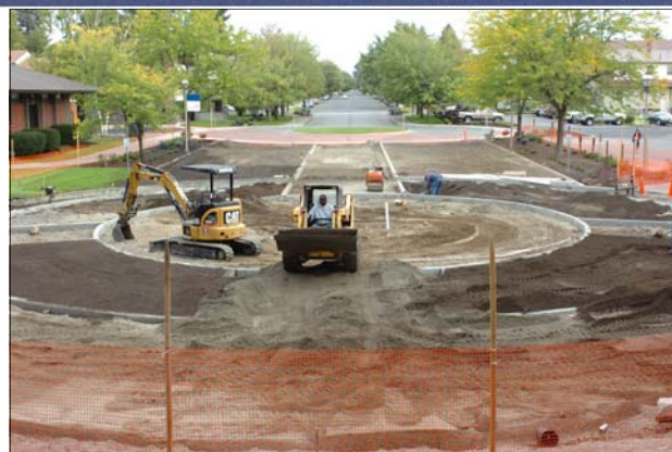
The outline of the new reflecting pool can be seen from the Administration Building front entrance.

Events will include a Friday evening social in the Globe Room, faculty discussions, dinner at the MacCarthy Center, a family picnic and an alumni mass on Sunday.