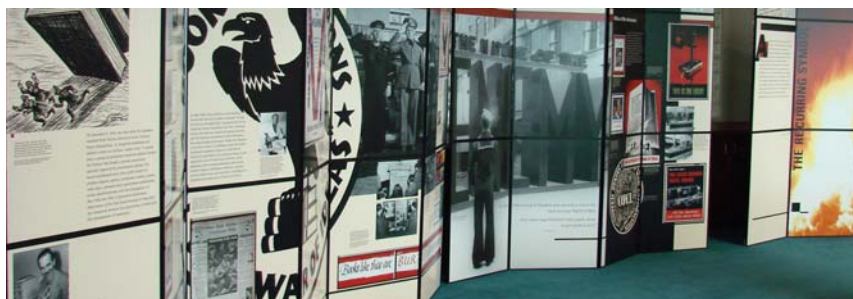
Exhibition displays in the Special Collections Rare Books Room